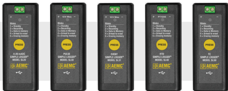
Model SL20 Model SL30 Model SL31 Model SL40 Model SL50

Models available for logging DC Current, Temperature, Pulse and Events