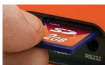
SD memory card included

Transfer data from meter to PC using Excel® software and datalogged readings from the SD memory card (included)