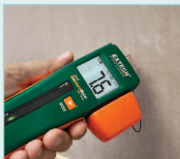
Measures % of Moisture in sheet rock and other building materials using direct pin method. Protective cap snaps onto the side of the housing during use.