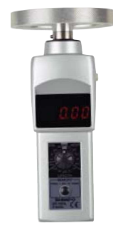
12" Aluminum Wheel