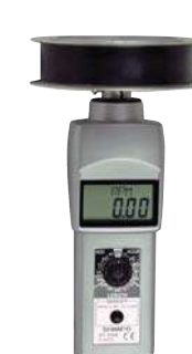
12" Cable Wheel