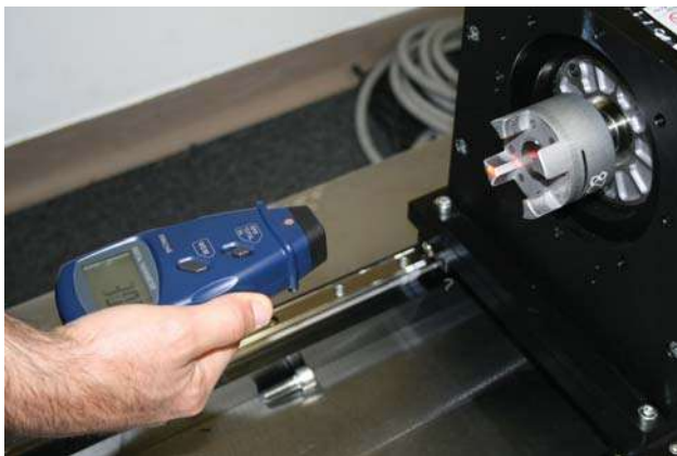
PT-110 recording rotational speed of machinery.