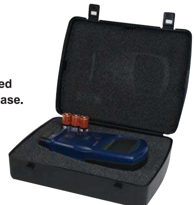
PT-110 with included protective carrying case.