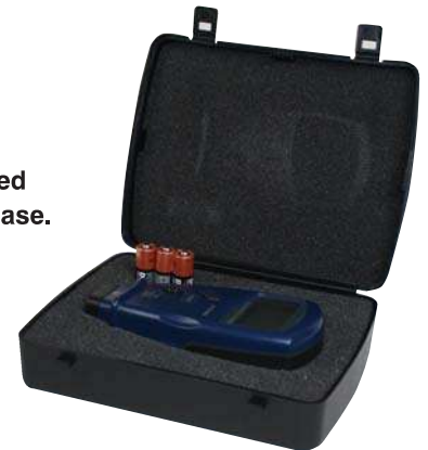
PT-120 with included protective carrying case.