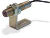
Remote Infrared Sensor (IRS-P) Gap 0.50 inches

Remote Contact Assembly (RCA) with 6 foot (1.82m) cable, Contact Tips and 10 cm Linear Contact Wheel (Shows optional 12 inch circumference Linear Contact Wheel)