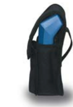
Protective Carry Pouch with belt loop (optional)