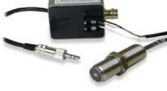
Remote Magnetic Sensor (MT-190-P) Gap 0.25 inches