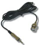
TTL pulse Input/output cable with BNC connector