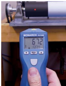
Pocket Laser Tach 200