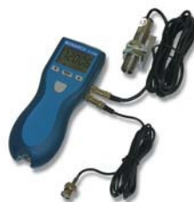
PLT200 shown with optical sensor and TTL output cable