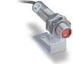
Remote Optical Sensor (ROS-P) Gap 36 inches

Optional plug-in Remote Sensors with 8 foot cable. (25 foot cables available). See page 9 for details.