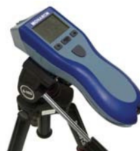
PLT200 and PT99 have a 1/4 20 threaded bushing for tripod mounting

The rugged and versatile Pocket Laser Tach is ideally suited for non-contact, contact and linear speed measurements.