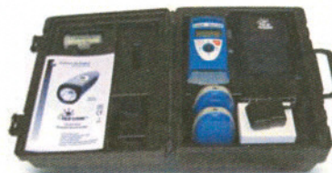
Palm Strobe x Deluxe Kit

Unlimited Power World's First Stroboscope with removable, rechargeable battery pack (patented).