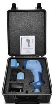
Deluxe Kit Case