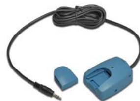
Remote Laser Dock