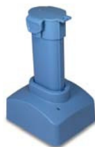
Battery Recharging Station

A/C Power Adapter - The 115/230 A/C power adapter allows for continuous operation. Included with certain models or may be ordered separately.