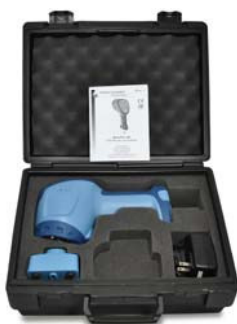
Standard Kit Case