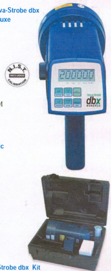
Nova-Strobe dbx Deluxe

Select optional sensors for tachometer mode (see page 9)