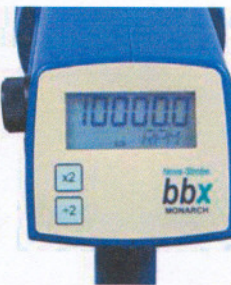
Nova-Strobe bbx/bax Basic Digital LCD Display