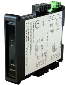
A Laureate RTD or thermocouple transmitter can be mounted inside or outside of the display housing.

Standard outputs that come with the Laureate transmitter are an isolated analog output and dual 120 mA solid state AC/DC relays. Their setup requires connection to a PC via the transmitter's RS485 port, and it uses Laurel's free Instrument Setup Software.