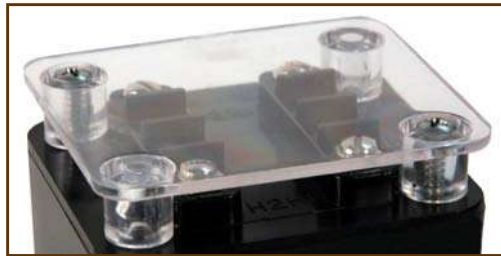
Clear Plastic Cover