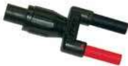
Banana (female) - BNC (male) Adaptor Catalog #2118.46 (optional)

**Available as special orders only. Contact customer service for current list price.