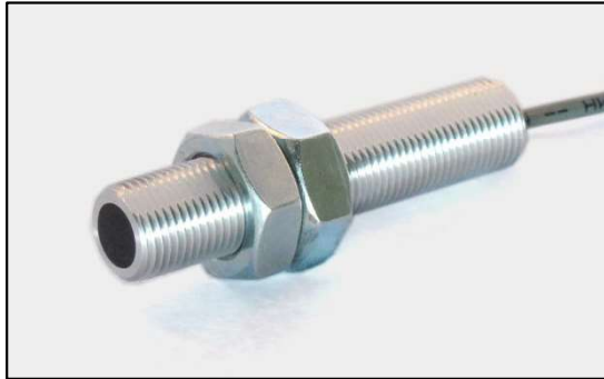
Model MGS0303, Ferrous Speed Sensor Photo shows flat side of sensor for indexing.