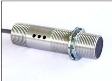
Model ZS09P, with Power Relay Device contains sensor and relay.