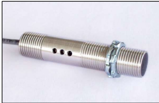
Model ZS09R, with Reed Relay Device contains sensor and relay.