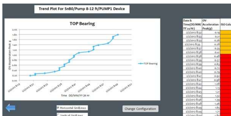
Sample trend plot using the Fluke 805 trending template.