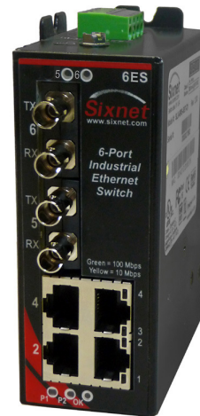
SLX-6ES-4/5 Aluminum Case Wide Temperature

We have been designing industrial hardware such as Remote Terminal Units for over 30+ years and have used this expertise to design the toughest Ethernet switches on the market. Don't trust your critical communications to so-called industrial hardware from commercial switch manufacturers. Sixnet switches give you proven assurance that your system will keep running for years to come.