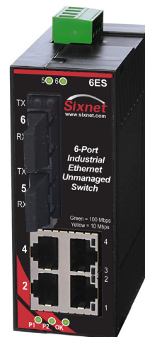
SL-6ES-4/5 Lexan Case Standard Temperature